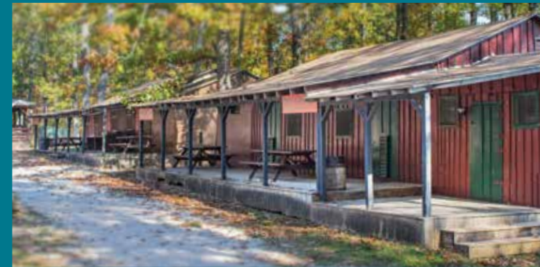
Current state of the Fort Roller cabins. Two are pictured, but there are six in total that need to be replaced.

Thank you to all who've already given toward Phase 2, enabling the renovation of the Hilltop Hall Dining Room and Kitchen! [see photos below]